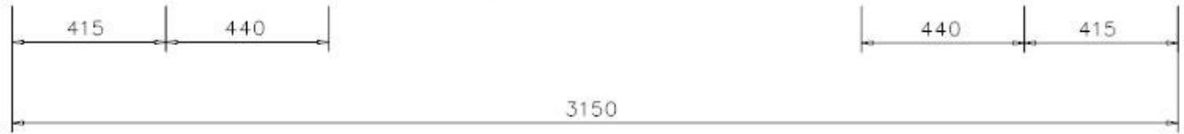
PLAN WITH ROOF REMOVED